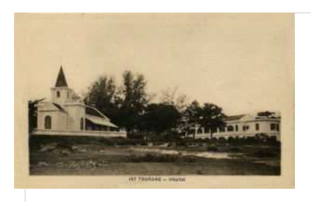
Annam – Tourane – Hôpital

A second hospital, the Hôpital indigène de Tourane, was established in 1906 on boulevard de la République (now the site of the Đà Nẵng University of Medicical and PharmaceuticalTech- nology at 99 Hùng Vương) to serve the local population. Then in 1909-1911, the military hospital was upgraded and rebranded as the Hôpital européen de Tourane, in which capacity it continued to serve Tourane's military and civil population for the remainder of the colonial era.