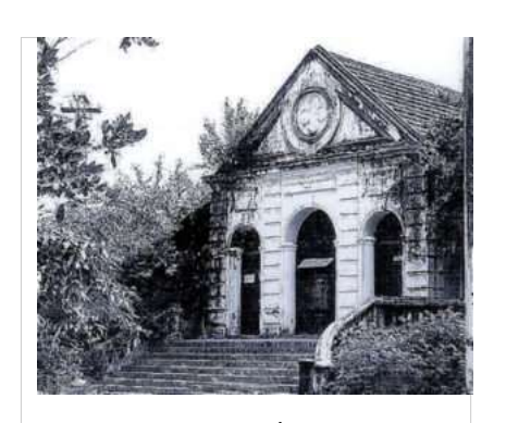
Annam – Tourane – Église de Tourane

It was also inside the Citadel in 1900 that the devout General Gustave Borgnis-Desbordes, Commandant-in-chief of French troops in Indochina and Grand officier de la Légion d'honneur, sponsored the construction of Tourane's first Roman Catholic chapel. This remained the principal place of Catholic worship in the city until the inauguration of the larger parish church, now Đà Nẵng Cathedral, in 1924.