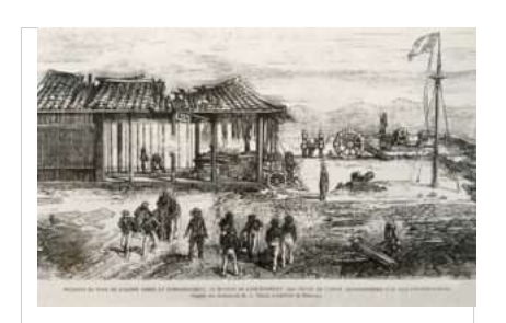
Intérieur du fort de l'Ouest après le bombardement, au moment de l'enlèvement des pièces de canon abandonées par les Cochinchinois, d'après les dessins de M. A. Theil, à bord de la Némésis

fVietnamese warships by the French frigates Gloire and Victorieuse in the harbour. Built according to the Vauban principles of military architecture (see previous post, The Citadels of Gia Dinh), it was a smaller version of the 1837 Gia Định Citadel (Saigon), square in shape with a circumference of 556m, 5m high walls, four diamond-shaped corner bastions, and a 3m deep surrounding moat.