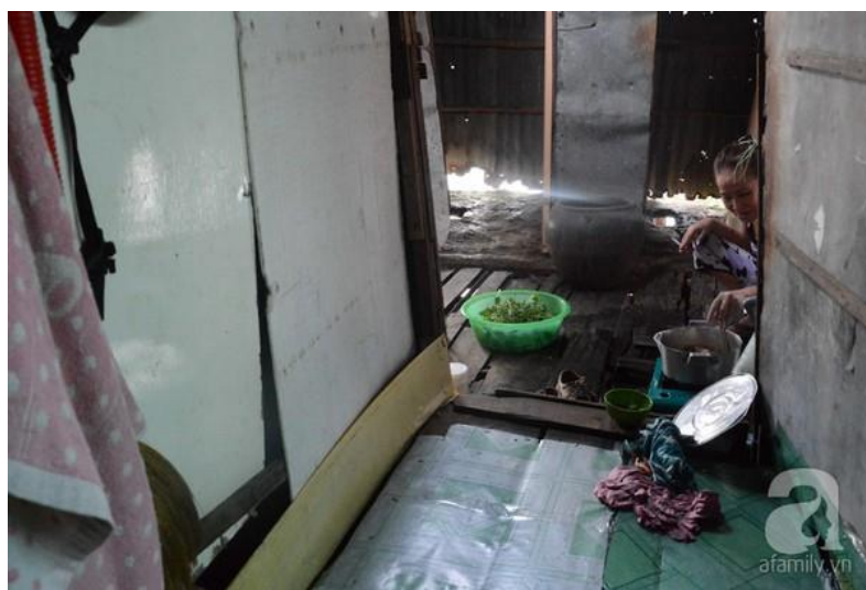
Inside a slum.