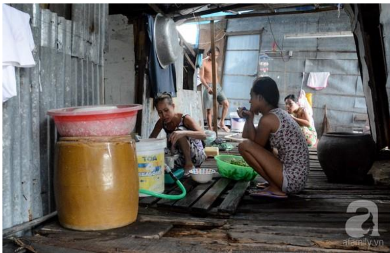
These houses are inhabited by poor families and working people.