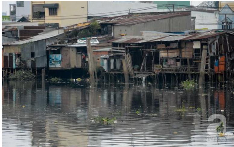
Slums are located along or on the banks of major canals in the city, including Tau Hu, Thi Nghe, Te, Doi, and Tham Luong, which are all heavily polluted.