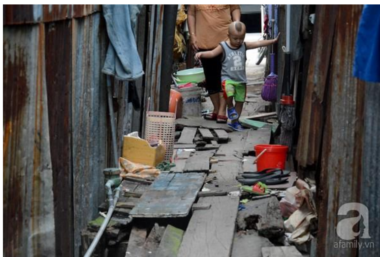
The entrance to a slum on Tran Xuan Soan Road, District 7. The path to the slum is made from rotting wood pieces, which can fall down to the canal anytime.