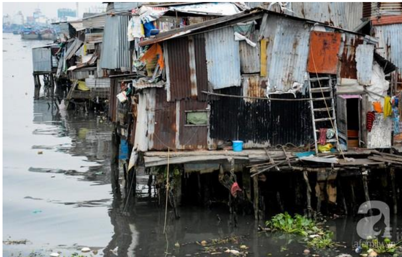
The slum areas are built with rusty iron sheets and rotting boards.