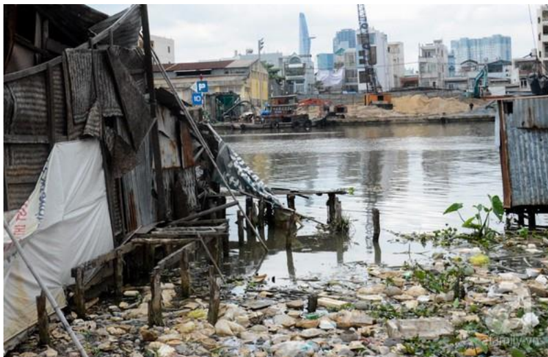
The slums along Te and Doi canals, far behind the Bitexco building. Most of the waste is discharged directly into the water.