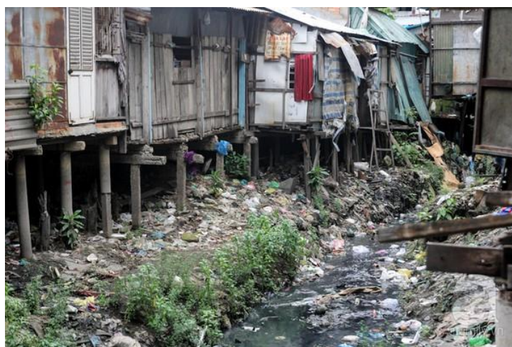
The slums on Thi Nghe canal, near Bui Huu Nghia Bridge, Binh Thanh District. Local people also discharge all waste directly into the canal.