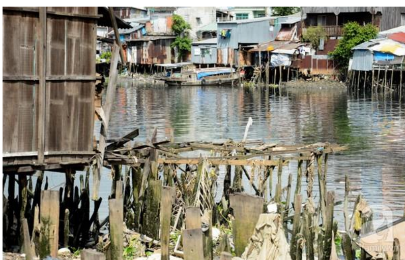
Most of the houses are 3m wide, 15m long, with about 10m located on the water. However, the pillars are rotting and they can collapse at any time.