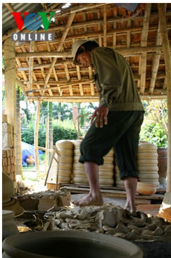
Preparing raw materials.