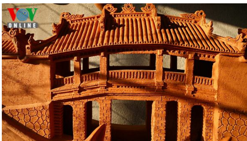
Cau (Bridge) Pagoda.