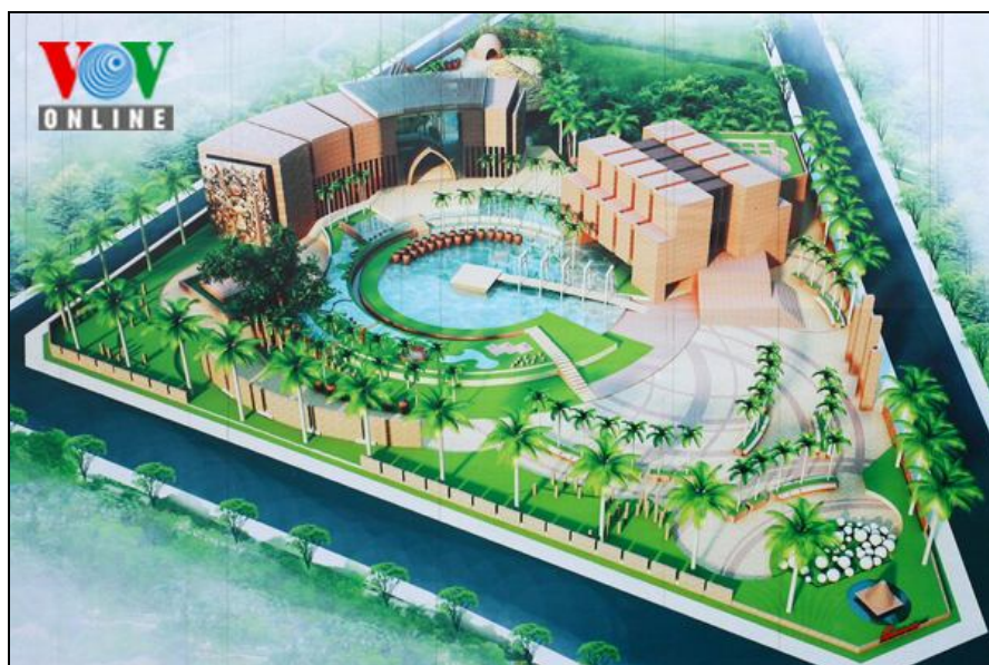
A model of ceramic cultural park.