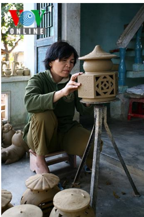
Sculpturing with a flourish.