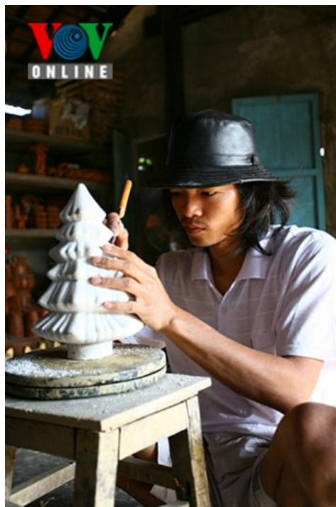
Decorating pottery products.