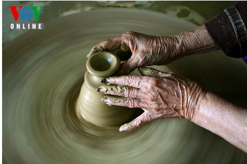
Shaping ceramic products.