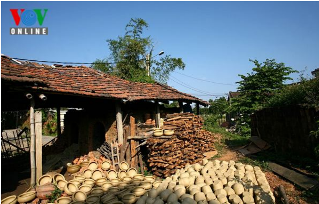
A corner of ceramic craft village.

Thanh Ha ceramics and other crafts, such as Kim Bong wood making, Cam Kim mat making and Tra Que vegetable growing, have contributed to the creation of a series of craft villages around Hoi An city. Ceramic products of different shapes and sizes are produced at Thanh Ha, including pots, bowls, vases, cups, jars, bricks, tiles, and other things of artistic values. Currently, about 20 local households are engaged in making ceramics, which are renowned for their unique features, distinctive characteristics, and special colours as they are manually made and burned in kilns.