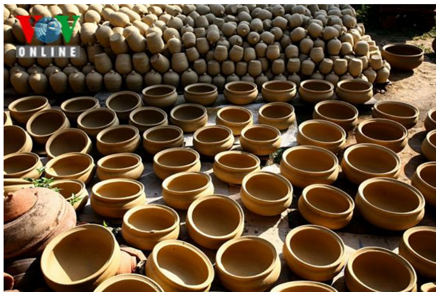
Traditional ceramic products.