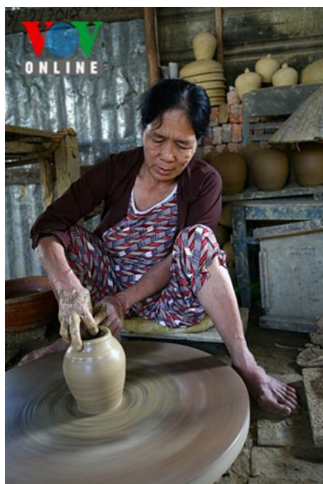
Making ceramic products in a traditional way.