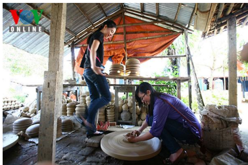
A good try by tourists.