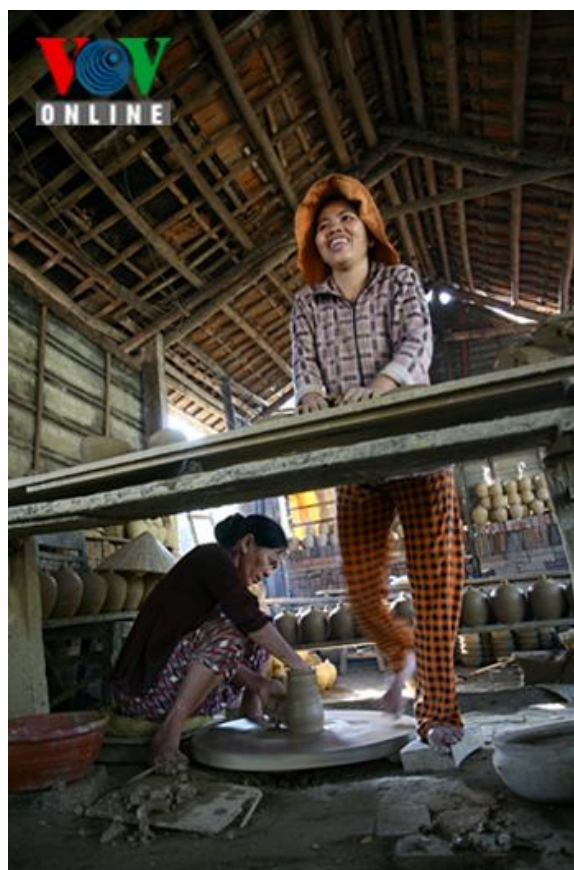
Working in pairs.