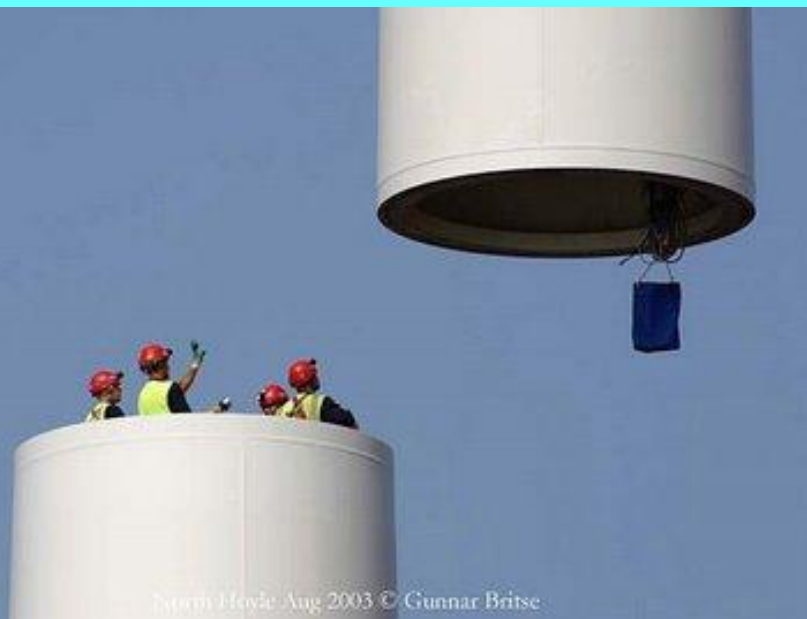
Nordhavn Aug 2003 © Gunnar Britse