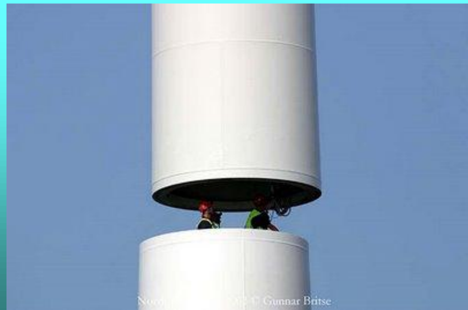
Nordhavn Aug 2003 © Gunnar Britse